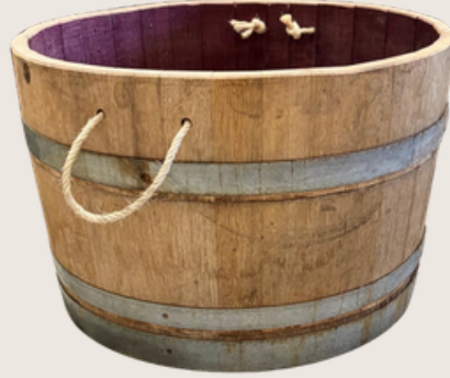
PLANTER WITH ROPE HANDLES