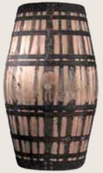
PORT BUTT "Pipe"