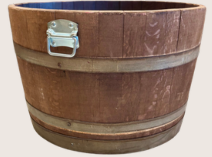
PLANTER WITH METAL HANDELS