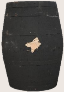
OLD OLOROSO OR PX