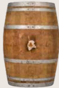
STR HOGSHEAD SEASONED WITH OLOROSO & PX WINE