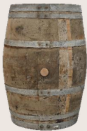
FRENCH SWEET WINE